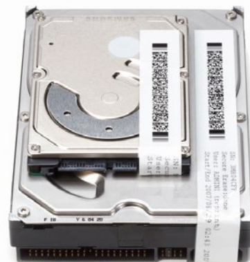
Media shown with secure erase confirmation tags.